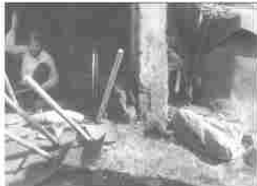
Work and Home