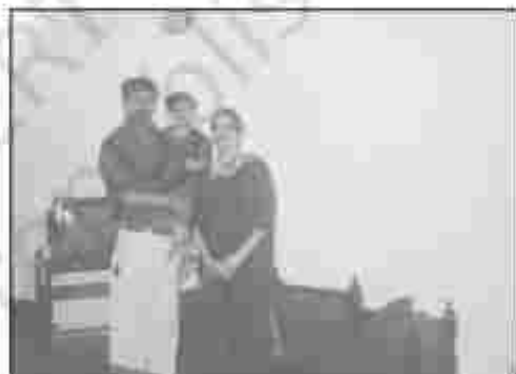
Notice how families and residences are different