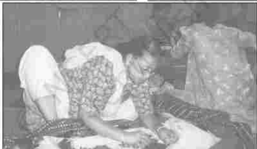
Different Types of Work

physical effort, which has as its objective the production of goods and services that cater to human needs.