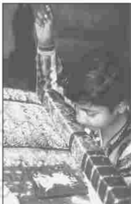
Discuss the visual

The report indicates how gender and caste discrimination impinge upon the chances of education. Recall how we began this book in Chapter 1 about a child's chances for a good job