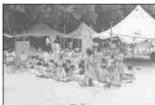
Discuss the visuals (Two types of schools)